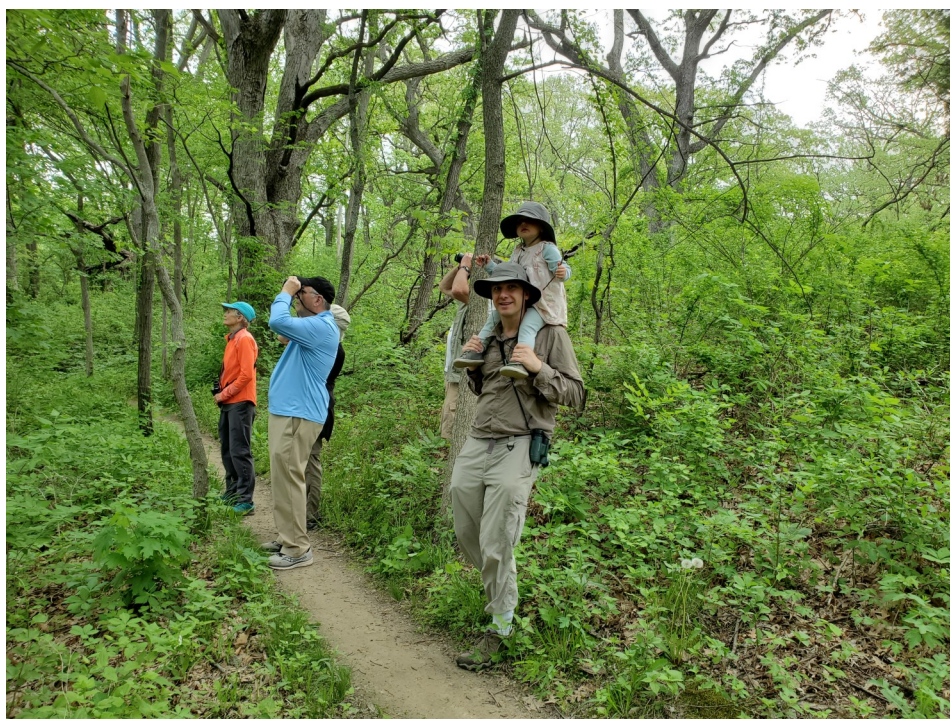
Barred owl and Field Trip