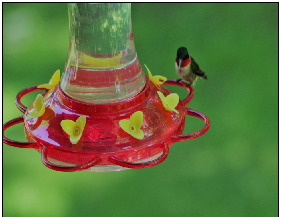
Ruby-throated hummingbird on feeder