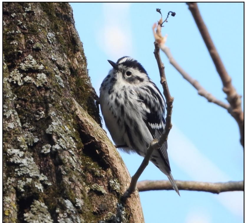
Black and White Warbler

If you have any events you would like us to post, please let us know by sending a note to qcaudubon@gmail.com