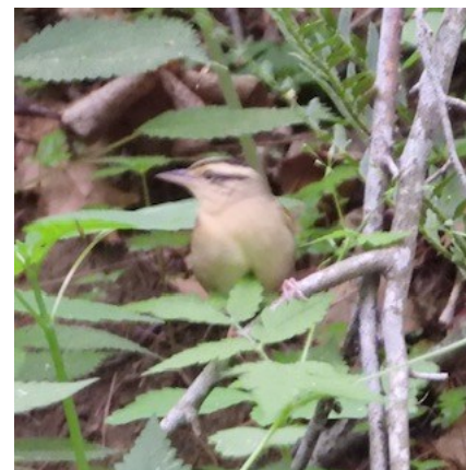
Below: Worm-eating warbler