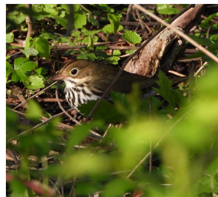
Left: Red-eyed vireo