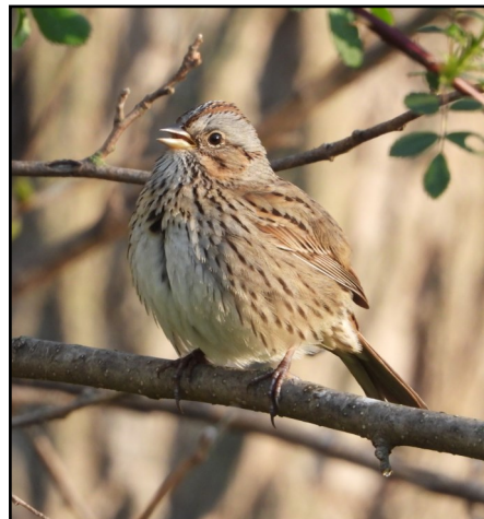
American Redstart and Song Sparrow