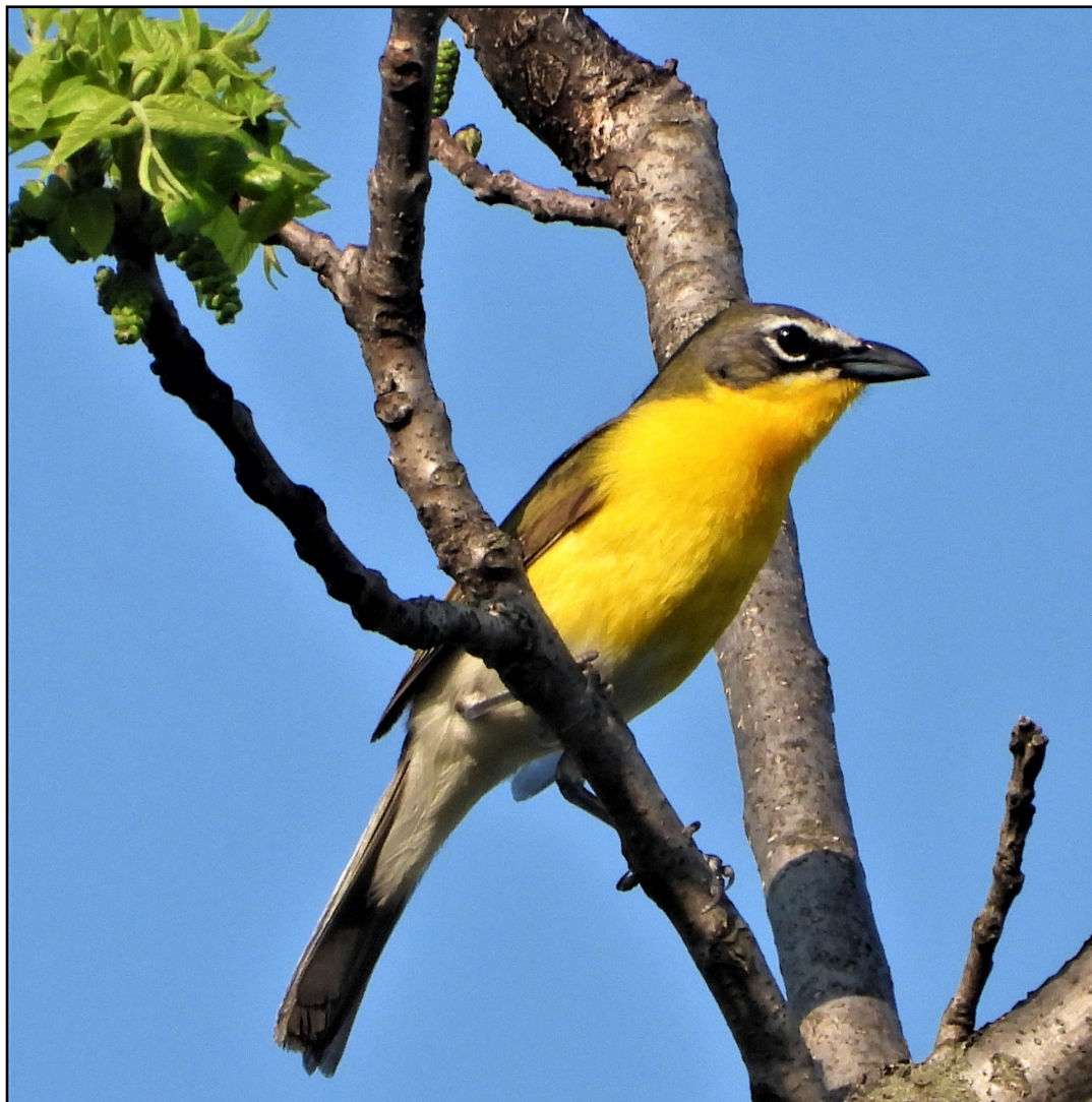
Yellow- breasted Chat

Photo taken in Bettendorf by Susa Stonedahl.